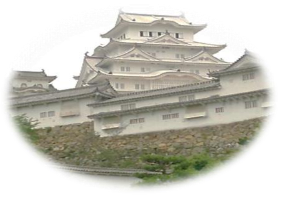
Students will experience authentic Japanese family life there and